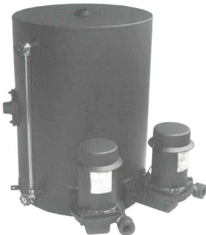
VERTICAL CONFIGURATION (Optional)